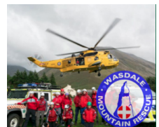
Wasdale MRT secretary@wmrt.org.uk