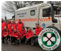
Cumbria Ore Mines Rescue Unit admin@comru.org.uk