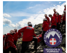
Duddon & Furness MRT sec@dfmrt.org.uk