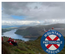
Patterdale MRT secretary@patterdalemrt.org.uk