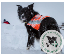
LDMR Search Dogs secretary@lakes-searchdogs.org