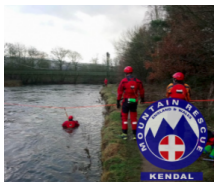
Kendal MSRT secretary@kendalmountainrescue.org.uk