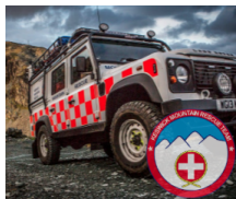
Keswick MRT secretary@keswickmrt.org.uk