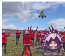
Kirkby Stephen MRT secretary@ksmrt.org.uk