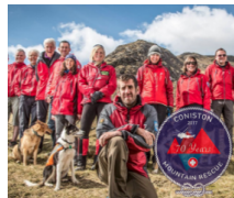
Coniston MRT secretary@conistonmrt.org.uk