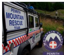
Penrith MRT secretary@penrithmrt.org.uk