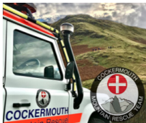
Cockermouth MRT secretary@cockermountmrt.org.uk uthmrt.org.uk

For more general enquiries, most teams can be contacted via their website or in some cases Facebook pages. Links to the team websites can be found by visiting the LDSAMRA website: www.ldsamra.org.uk