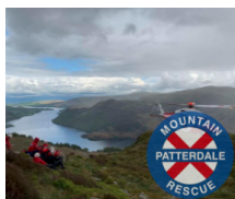
Patterdale MRT secretary@patterdalemrt.org.uk