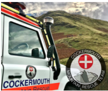
Cockermouth MRT secretary@cockermouthmrt.org.uk

For more general enquiries, most teams can be contacted via their website or in some cases Facebook pages. Links to the team websites can be found by visiting the LDSAMRA website: www.ldsamra.org.uk