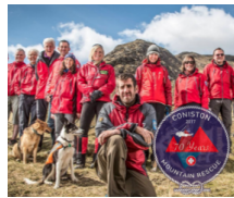
Coniston MRT secretary@conistonmrt.org.uk