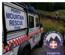
Penrith MRT secretary@penrithmrt.org.uk