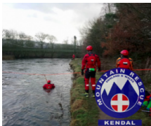
Kendal MSRT secretary@kendalmountainrescue.org.uk