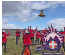
Kirkby Stephen MRT secretary@ksmrt.org.uk