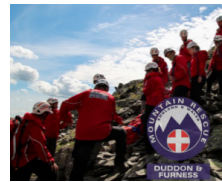
Duddon & Furness MRT sec@dfmrt.org.uk