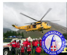
Wasdale MRT secretary@wvmt.org.uk