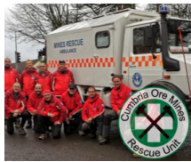
Cumbria Ore Mines Rescue Unit admin@comru.org.uk