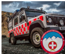
Keswick MRT secretary@keswickmrt.org.uk